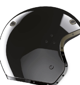
Hemi Std Gloss Black