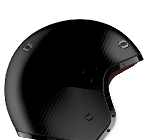
Hemi Std Matte Magic Black(dark carbon)