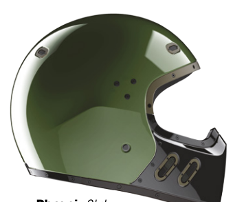
Phœnix Std Two Tone Gloss Olive Green