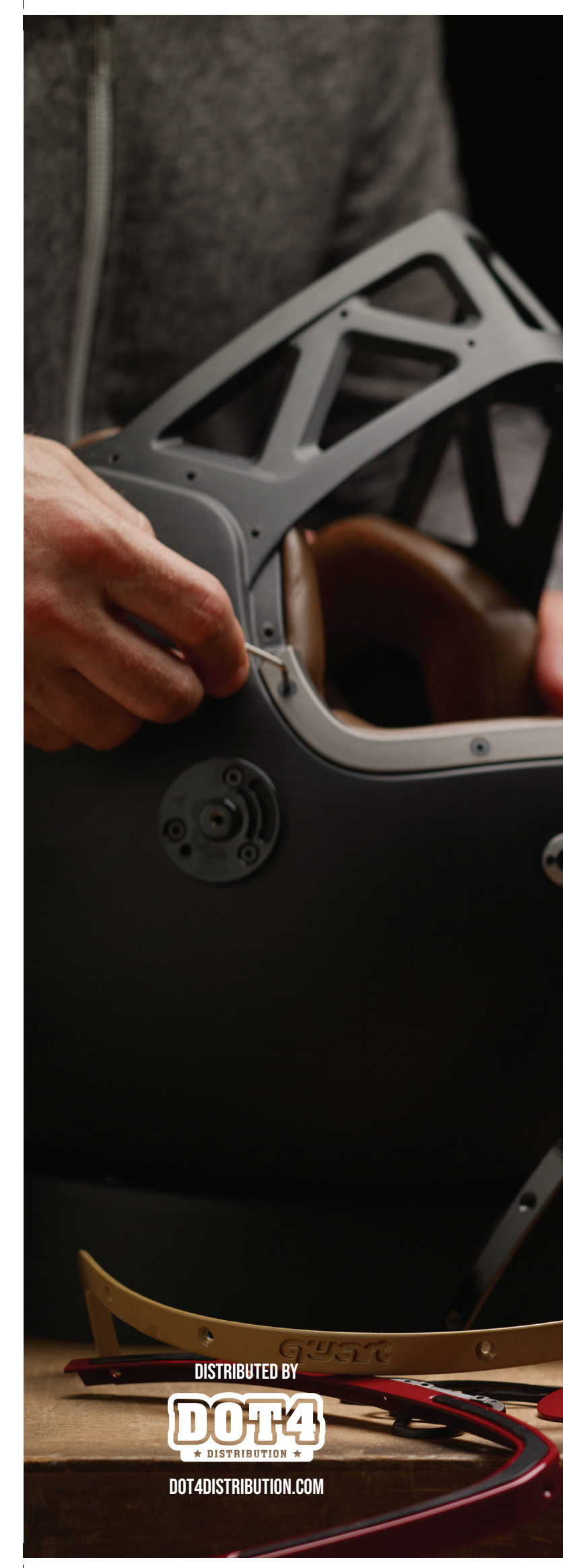
Leismo Revo / White Leather