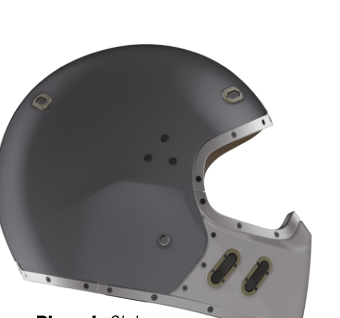
Phœnix Std Two Tone Matte Titanium