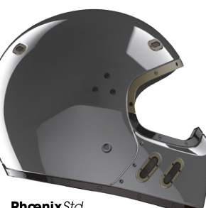
Phœnix Std Gloss Nardo Grey