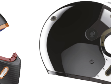
Phœnix Std Black-White Mix/Example