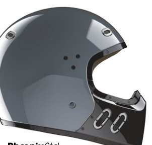
Phœnix Std Two Tone Gloss Horizon Blue