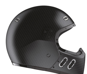
Phœnix Std Matte Carbon

Phœnix & Hemi Sta users could customise their helmet with a visor (tinted or clear) which is available as an option. On the other hand, customers who decided on a Slick model without any clipping system for a visor should consider the Qwart Leismo goggles (see below).