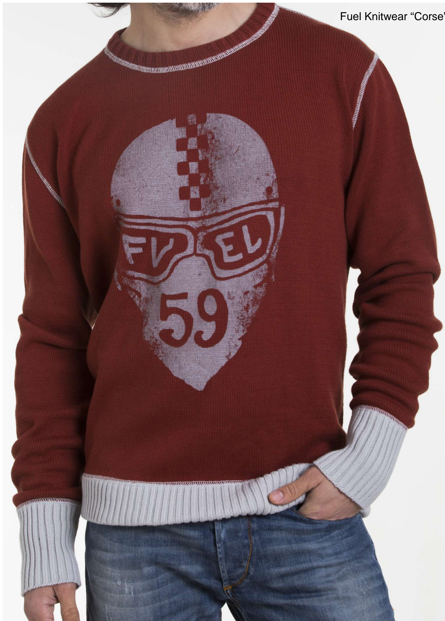
Fuel Knitwear "Corse"