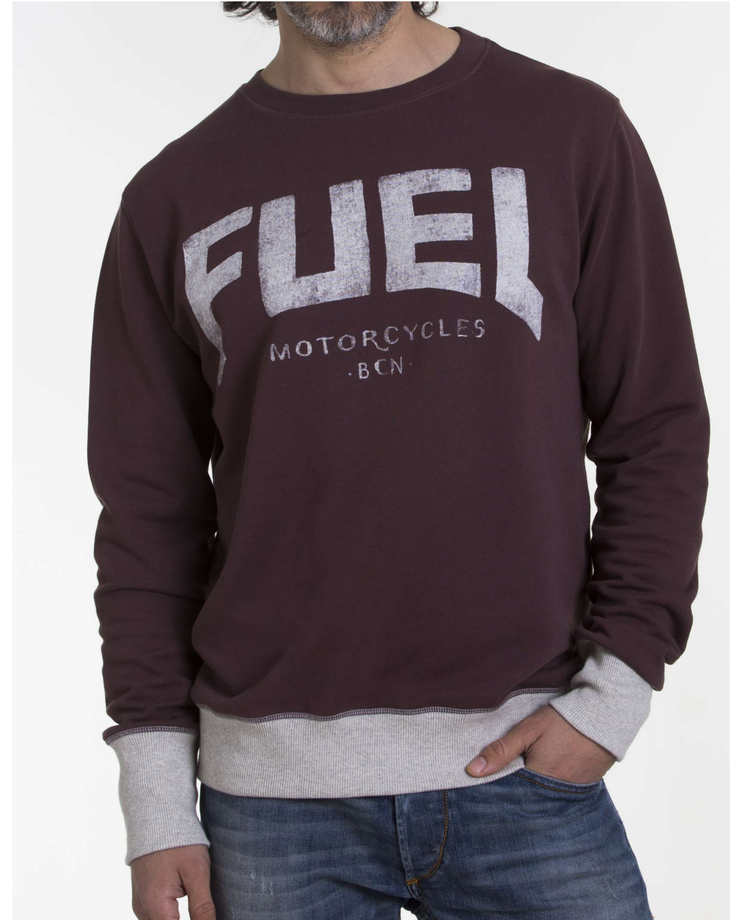
Fuel Sweatshirt “Bordeaux”