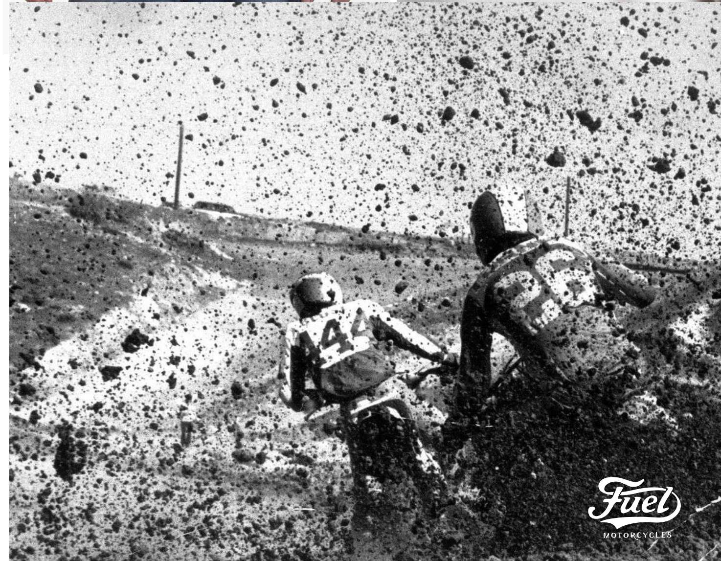
Fuel Long sleeve "53"