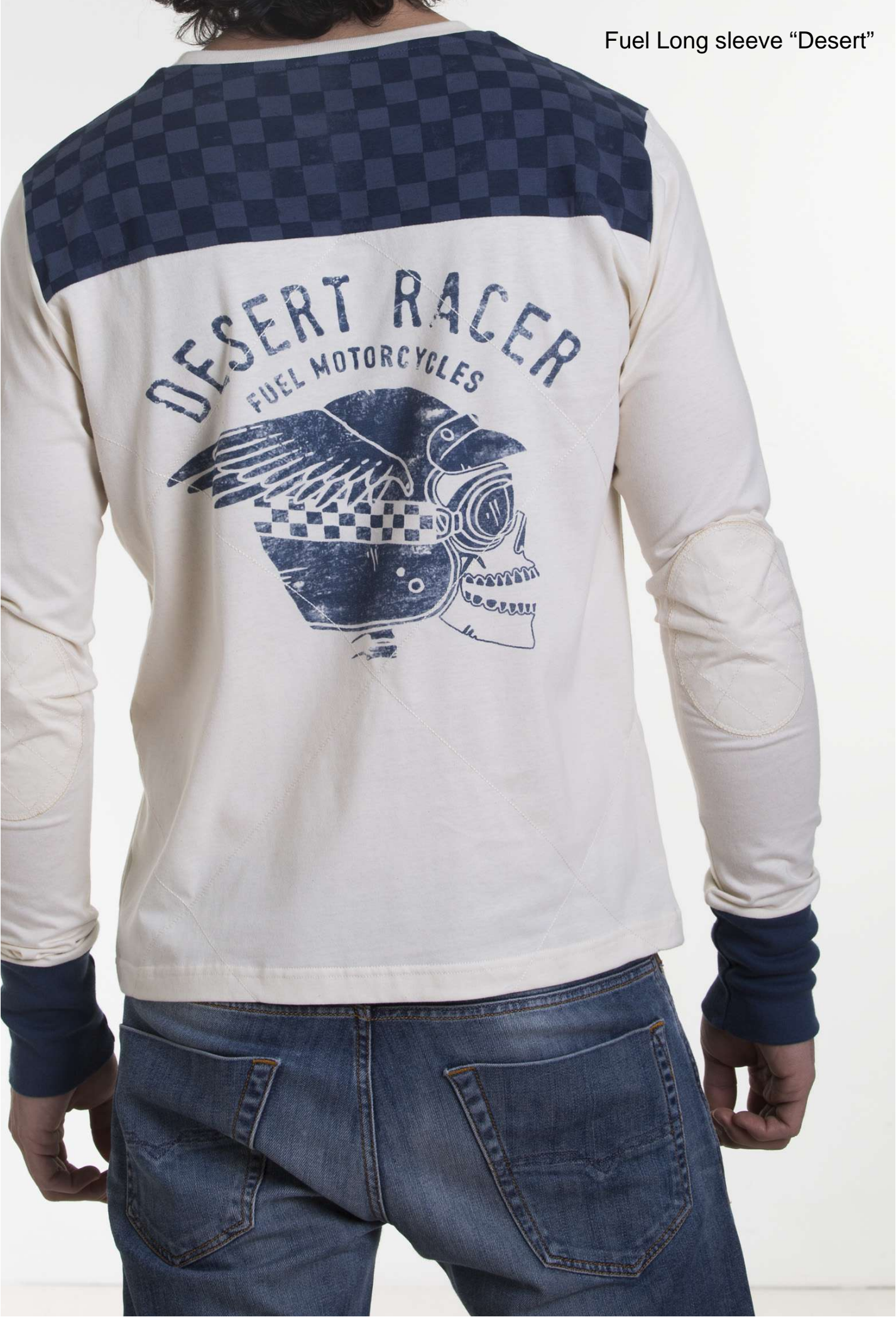
Fuel Long sleeve "Desert"