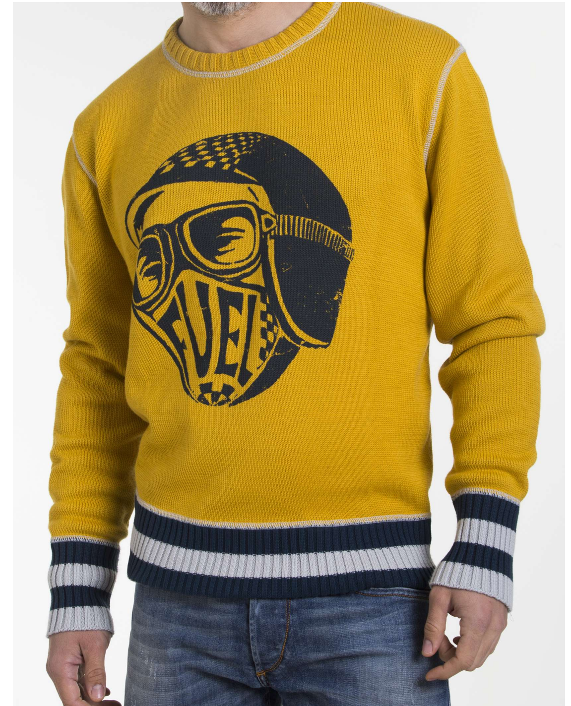
Fuel Knitwear "Steve"