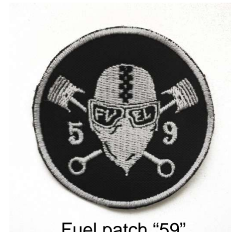
Fuel patch "59"