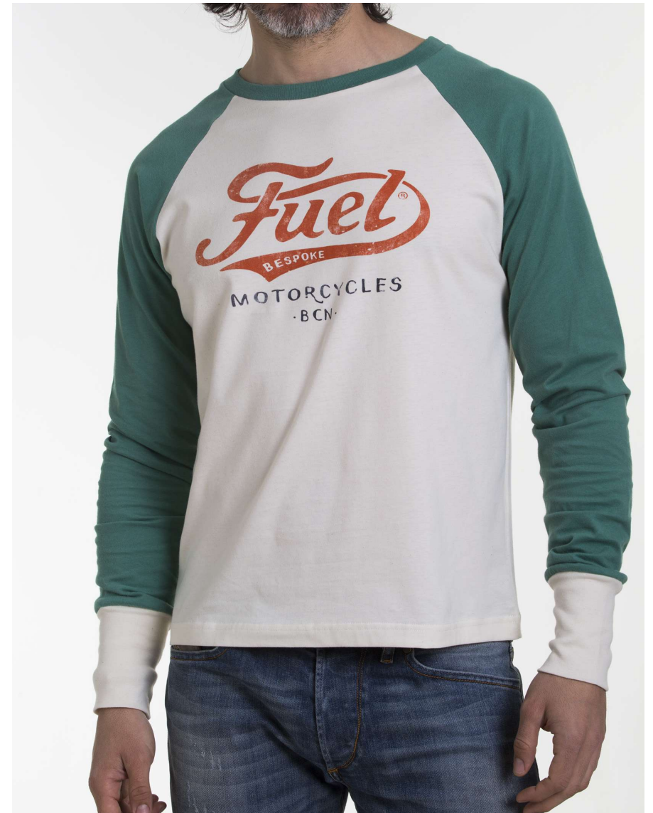
Fuel Long sleeve “Logo”