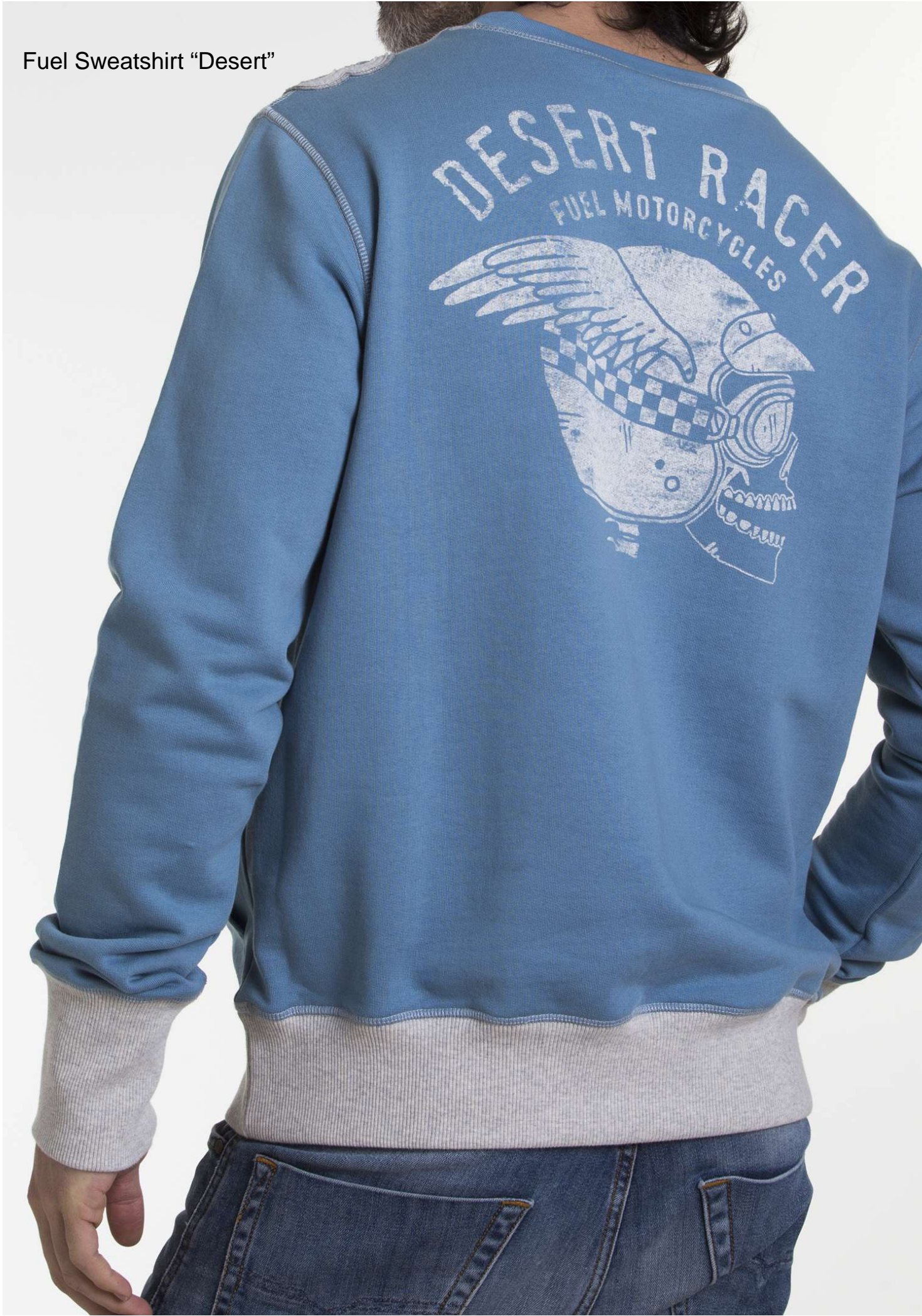
Fuel Sweatshirt “Desert”