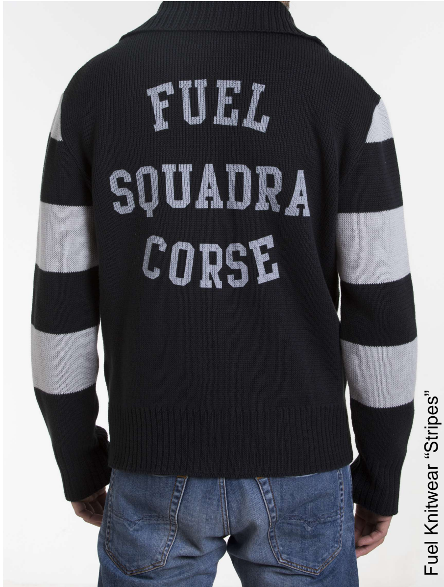
Fuel Knitwear "Stripes"